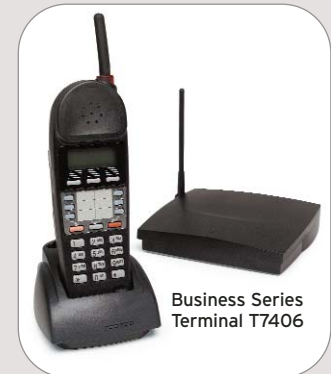
Business Series Terminal T7406

For small applications, you could also use Norstar Business Series Terminal T7406 cordless phones with a Norstar or Business Communications Manager core platform. This economical option enables one to six users to roam up to 300 feet from a wall base, within 282,000 square feet of building space.